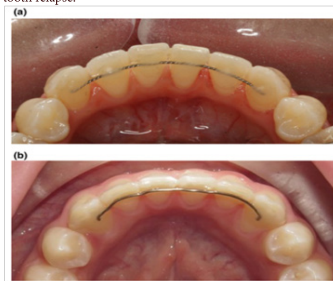
Fig No. 3: (a) Lower fixed retainer; Bonded only at teeth 33 and 43. (b) Lower fixed retainer; Bonded at all the lower incisor teeth.

Fixed retainers offer the advantage of being in place permanently which removes the need for patient compliance with retainer wear (Figure 3, the retainers are typically bonded to the palatal/lingual surfaces of the labial segments. As they cannot be removed for cleaning, they are more prone to plaque and calculus accumulation. 11 It is therefore vital that patients are provided with clear instructions on oral hygiene measures associated with their bonded retainers. The retainers also need to be checked regularly to ensure that they are still bonded in place. In addition, there are reports of occasional, severe, unwanted tooth movements caused by different types of failed/faulty fixed retainers as a result of the bonding of some or all teeth within the span of the fixed retainer. 22,23,24 This method of retention makes the clinician responsible for the maintenance of the fixed retainer. It is critical during the informed consent process that patients are made aware that if appliance maintenance is not performed by either their orthodontist or general dentist, they are at risk of tooth relapse.